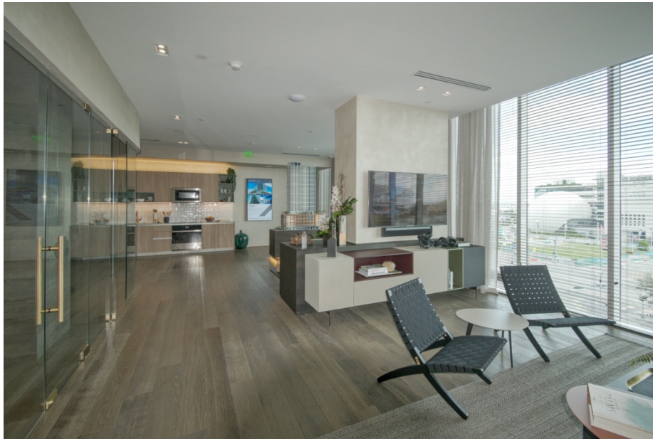
Natiivo Miami suite vignette

Finally, the 10th floor's 18,000-square-foot fitness centre is replete with exercise equipment, spa and treatment rooms, and an outdoor training terrace for guests to stay active.