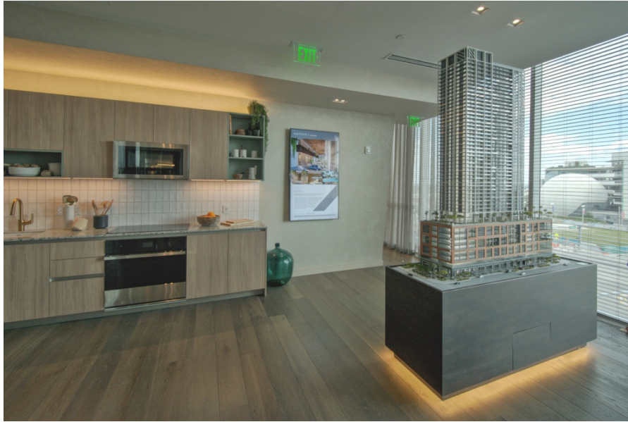
Natiivo Miami scale model and suite, image by Marcus Mitanis

Residences curated by interior design firm Urban Robot reflect the cultural vibes of Downtown Miami, juxtaposing contemporary finishes with tropical and organic accents. Residences span between 410 and 2,200 square feet and feature panoramic ocean and city views. Private balconies, European kitchen cabinetry and stainless steel appliances come standard.