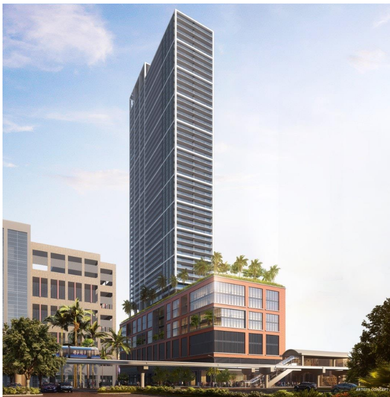
Natiivo Miami

A 51-storey highrise development proposed for Downtown Miami aims to bring together hospitality and hoemsharing under one roof. Natiivo Miami , developed by Newgard and designed by Arquitectonica , is the first purposefully designed, built and licenced building for homesharing in the city.