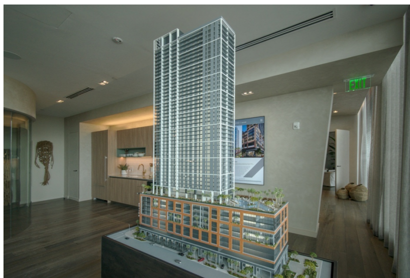
Natiivo Miami scale model

Owners can do with their units whatever they like, whether renting to short-stay guests or renting to long-term tenants. Natiivo Miami offers the same amenities and services a hotel would—the development's MasterHost facilitates the guest stay experience with a 24-hour concierge service and housekeeping.