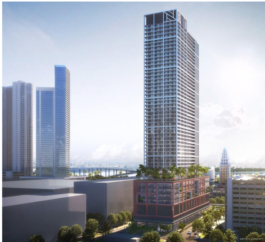
Natiivo Miami

Owners can do with their units whatever they like, whether renting to short-stay guests or renting to long-term tenants. Natiivo Miami offers the same amenities and services a hotel would—the development's MasterHost facilitates the guest stay experience with a 24-hour concierge service and housekeeping.